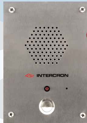
Model IC-RT / S / AI