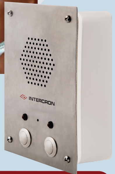
Model IC-RT / S / AI